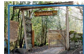
ENCHANTED FOREST (090) 974 5246 www.slieveaughtycentre.com