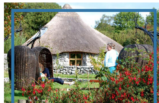
BRIGIT'S GARDEN (091) 550 905 www.brigitsgarden.ie