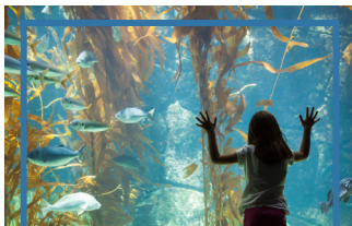
GALWAY ATLANTAQUARIA (091) 585 100 www.nationalaquarium.ie