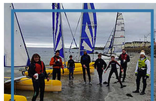
GALWAY BAY SAILING email: info@gbsc.ie www.gbsc.ie