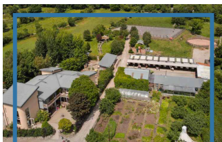
SLIEVE AUGHTY CENTRE (090) 974 5246 www.slieveaughtycentre.com