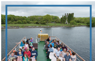
CORRIB PRINCESS 087 8065366 www.corribprincess.ie