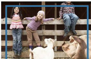
TUROE PET FARM (091) 41 580 www.turoepetfarm.com