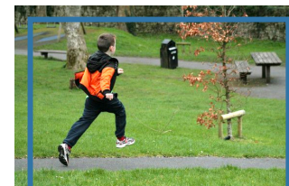
REVILLE PARK www.discoverireland.ie/ Arts-Culture-Heritage/ rinville-park/394