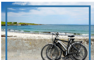
CYCLING TOURS 087 2056904 www.westirelandcycling.com