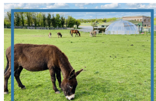
BURREN NATURE SANCTUARY (091) 637444 www.burrennaturesanctuary.ie