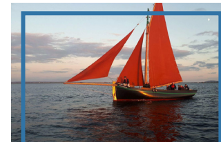
GALWAY BAY BOAT TOURS 087 2807028 www.galwaybaytours.com