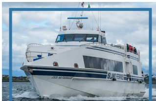
ARAN ISLAND FERRIES (091) 568903 www.aranislandferries.com